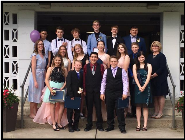
Congratulations to our Grade 8 Graduates!