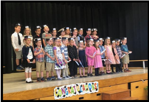
Congratulations to our Senior Kindergarten Class